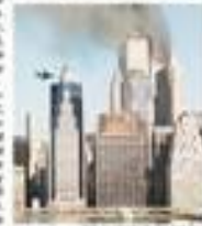
WORLD TRADE CENTER TOWERS IN NEW YORK CITY

President George W. Bush today vowed to exact punishment for the "evil" that struck the United States on Sept. 11. He said the attacks were a "day of infamy" and that he would lead the country in a "war on terror." He also said that the United States would not be intimidated by the attacks and that it would continue to stand for freedom and democracy.