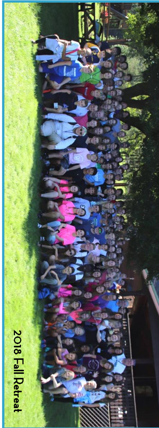
2018 Fall Retreat